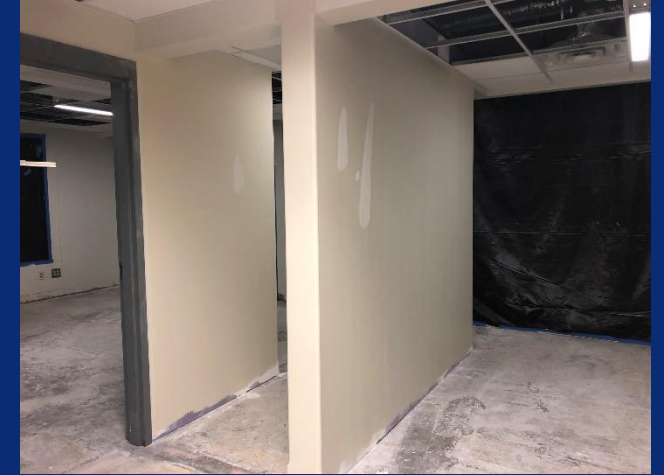
Administration Area 1 st Coat of Paint