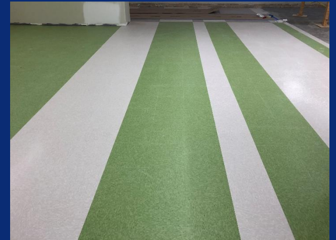
VCT Flooring in Area E