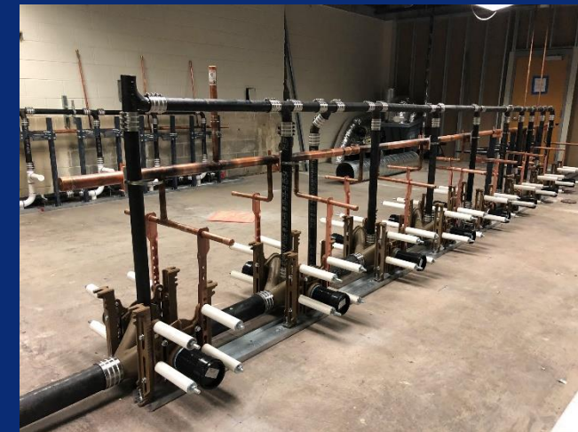
In Wall Plumbing in Area G Restroom