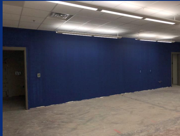
Classroom Accent Wall in Area E