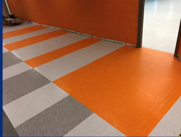
VCT Flooring in Area F