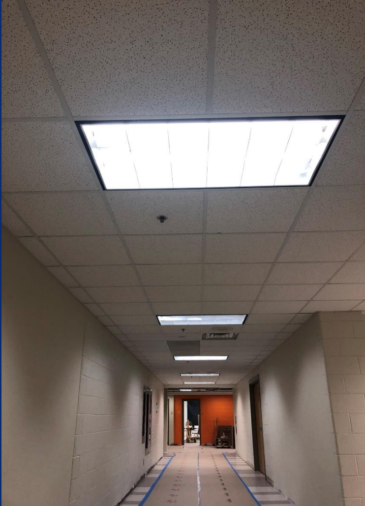
Ceiling Tile in Area F Corridor